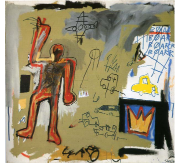
Basquiat. Untitled (Red Man). 1981.

Why was painting considered a dead practice in the 1970s? What art movements and artists were involved in this declaration? What kind of media were artists interested in exploring instead of paint? Consider one work (or artist) that provides evidence of the death of painting and describe how it asserts the irrelevancy of painting as a media.