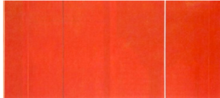
Barnett Newman. Vir Heroicus Sublimis. 1950 -51.