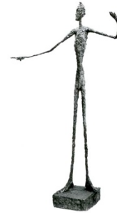
Alberto Giacometti. Man Pointing. 1947.

Define existentialism. (Hint: use a dictionary) Why were the members of the New York School attracted to this philosophy? How did it relate to the kind of artwork they created?