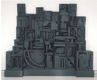
Louise Nevelson. Sky Cathedral. 1958.

Read the article “The World of Mrs. N.” and answer the following questions.