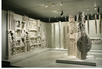
Louise Nevelson. Dawn's Wedding Feast. 1959.