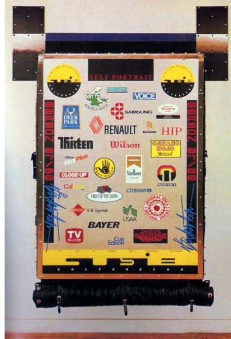
Ashley Bickerton. Tormented Self-Portrait (Susie at Arles). 1988.