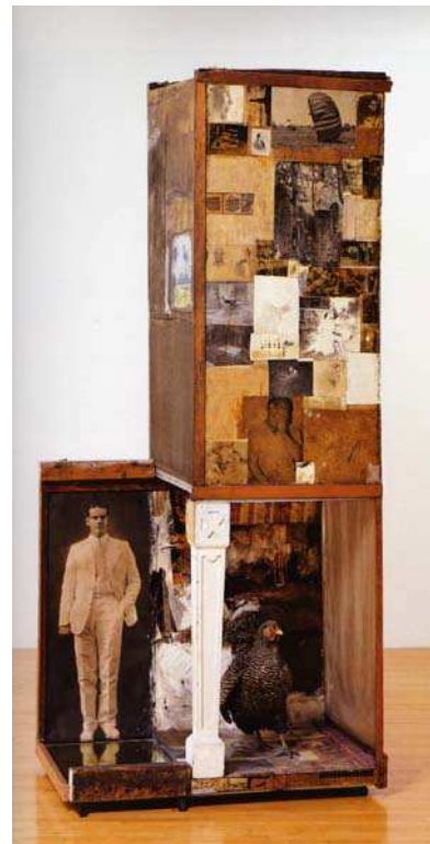
Robert Rauschenberg. Untitled (Man with the white shoes). 1954.