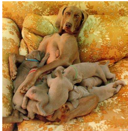
William Wegman. Mother's Day. 1997.