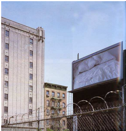
Felix Gonzales-Torres. Untitled. 1991.