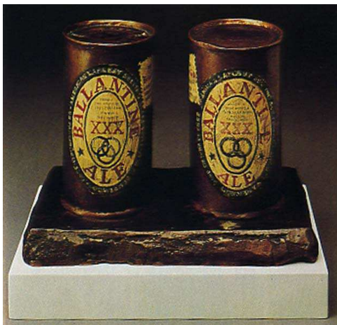
Jasper Johns. Painted Bronze. 1960.