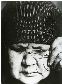
Aleksander Rodchenko. Portrait of My Mother. 1924.

Compare and contrast Carlton E. Watkins's Mt. Broderick with Ansel Adams's Valley View. How do the photographer's styles, approaches and methods differ? What role do the zone system and previsualization play in the imagery?