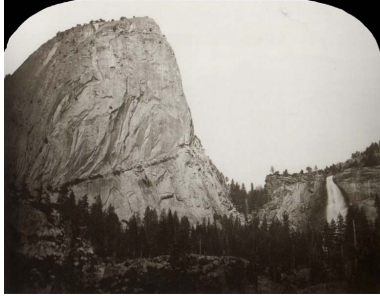
Mt. Broderick, Yosemite. 1861.