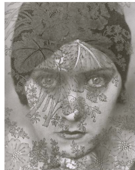
Edward Steichen. Gloria Swanson. 1926.

Compare and contrast Rodchenko's portrait with Steichen's. What New Vision techniques do these photographers employ? What was the purpose of creating such dramatically different views of the world?